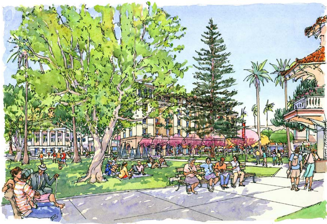
Previous Development Concept of Group C (Plaza Park North)

Downtown Oxnard represents an undiscovered opportunity for new development. It is located just three miles south of the 101 Freeway and three miles east of Channel Islands Marina and the Pacific Ocean. Anchored by Plaza Park, the Oxnard Transit Center, providing Amtrak and Metrolink train service, Carnegie Museum, historic Heritage Square, and a 14-screen movie theater, Downtown Oxnard is ripe for new residential and commercial development.